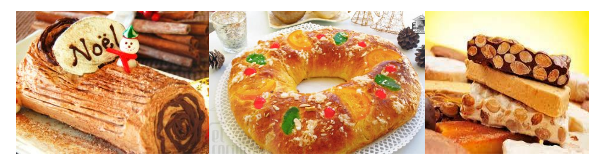
Team 2: sweet Xmas food (1A)

Round stuffed cake (Rosco de Reyes = 3 Wise Men sweet) Almond sweet