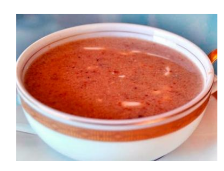
soup of amella