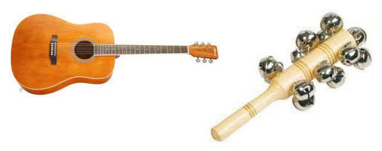
Team 3: traditional instruments for carols/images from carols P.1